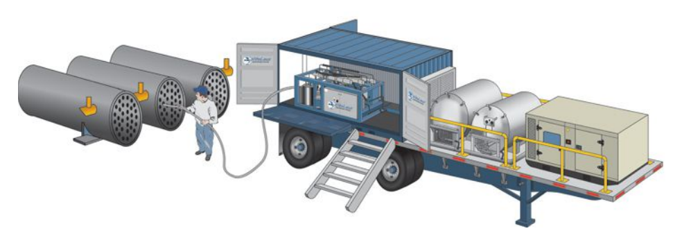
NitroLance™ mobile platform cleaning exchangers in place.

3. Thermal/volumetric expansion — As the high density liquid penetrates the cracks and crevices of