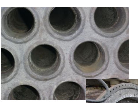
LN<sub>2</sub> cleaning mechanism of action

The ultra-high-pressure LN, cleaning technology owned and operated by Conco Industrial Services of Deer Park, Texas, is marketed under the brand NitroLance<sup>TM</sup>. The complete system is mounted on a mobile platform that is moved to close proximity of the heat exchangers being cleaned. The NitroLance hose and nozzle can extend up to 300 feet from the mobile platform while delivering LN, to the surface. NitroLance uses a controlled stream of LN, at variable pressures and temperatures to penetrate and break up just about any deposit. Using various nozzle configurations, NitroLance can clean both internal tube surfaces as well as external tube surfaces like those found on economizers, and can be configured to clean heat exchangers and process equipment encountered in sulfur recovery units and associated heat exchangers such as waste heat boilers, sulfur condensers and catalytic reactors to name a few.