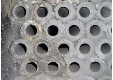
Before and after results using NitroLance™.

he use of pressurized liquid nitrogen The use of pressures 1.7 (LN<sub>2</sub>) as a safe and effective industrial cleaning tool achieved prominence in 2003 when the technology was utilized by NASA to clean components of the space shuttle. In a more recent (and down to earth) application, the cleaning benefits of LN, are being recognized as a highly effective means for removing tenacious fouling deposits encountered in petroleum refinery process equipment. As a result of the new technology, significant improvements are being seen in process flow rates and control, in process energy and pollution management, and reduction of equipment downtime associated with cleaning compared to high-pressure water blasting and other methods. On the subject of high-pressure water, an additional benefit of utilizing LN, is that it doesn't produce secondary waste streams, thus completely avoiding issues with crosscontamination and volatile reactivity with the process deposits being removed.