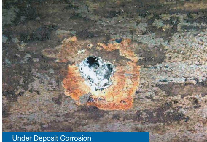
(Pitting Due to Manganese)

Copper is a natural antimicrobial material, and while copper condenser tubes disrupt the growth of some microbes, they are also prone to the formation of a hair-like oxide deposition that will disrupt heat transfer if left unattended. Stainless steel tubes are prevalent in midwestern U.S. power